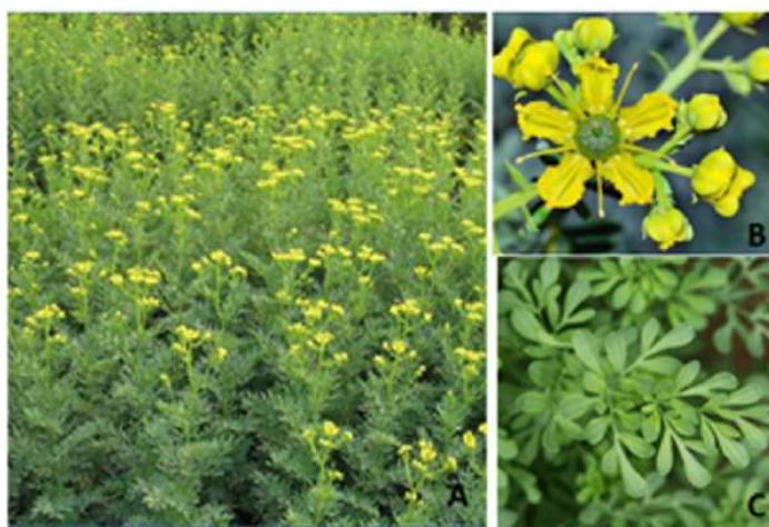
Figure 1. A- Plants of Ruta graveolens , B- its flowers, C- its leaves

The name 'rutin' has been drawn from the plant Ruta graveolens (common Rue) (Figure 1) whose aerial parts contain rutin. Rutin is a kind of flavonoid glycoside, also known as vitamin P or purple quercitrin, present in more than seventy plants species and food products of plant origin especially buckwheat seeds, apricots, cherries, grapes, grapefruit, onion, plums, and oranges (Kreft et