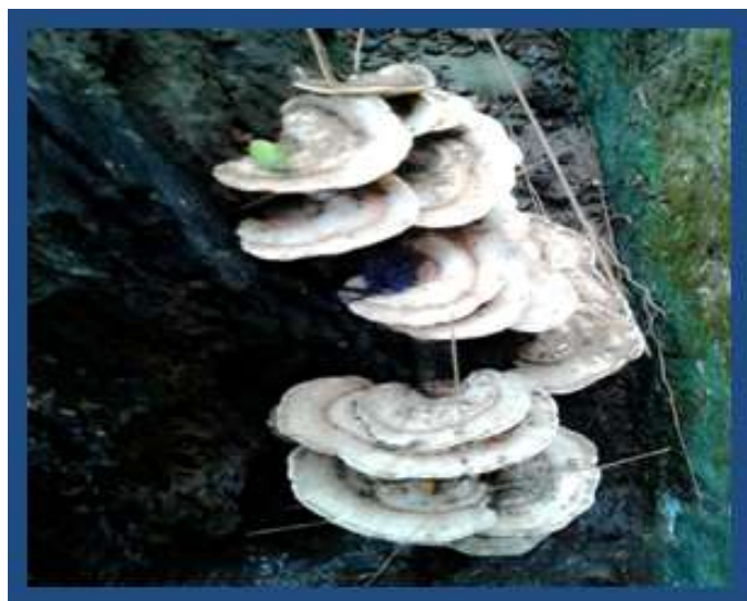
Figure 1. Picture of the Trametes hirsute species of Northern Samar, Philippines

photographed and collected, and any additional information or data not covered by the questionnaire were recorded. Collected specimens were brought back to the College of Science, University of Eastern Philippines, for further taxonomic verification.